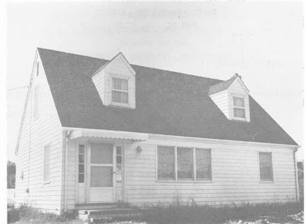
The Convent of the Sisters of St. Dominic